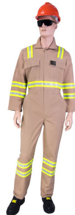
SAFEGUARD PRO - Khaki E3100529