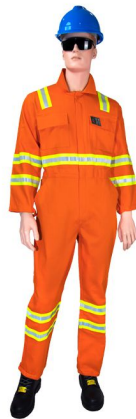
SAFEGUARD PRO - Orange E3100530