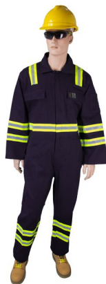
SAFEGUARD PRO - Navy Blue E3100528