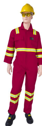
SAFEGUARD PRO - Red E3100531