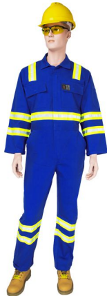
SAFEGUARD PRO - Royal Blue E3100532