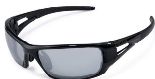
Flash Silver Mirror