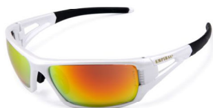
Flash Sky Red Mirror