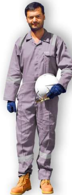
CHIEF Tapes - Grey A50505040