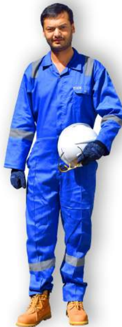
CHIEF Tapes - Patrol Blue A50505030