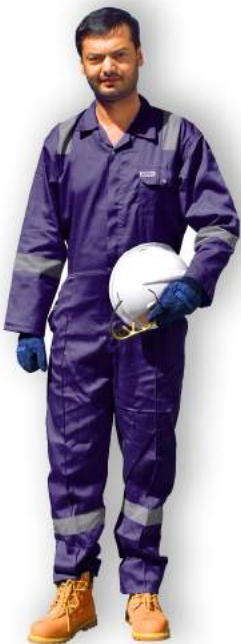
CHIEF Tapes - Navy Blue A50505070