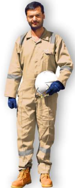
CHIEF Tapes - Khaki A50505050