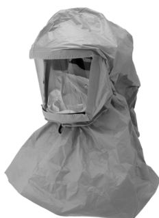
TURBINE H PAPR respirator with lightweight hood