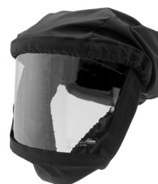
TURBINE FU PAPR respirator with lightweight hood