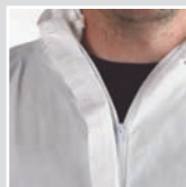
Single zip with resealable flap