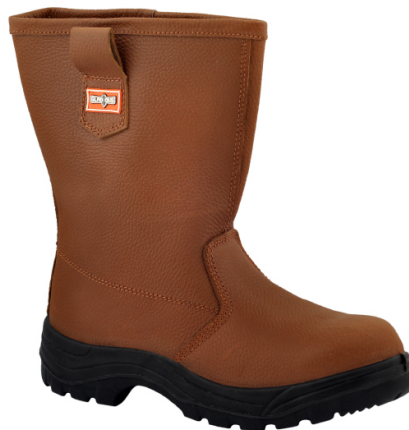
STRONGO - Tan G102030201