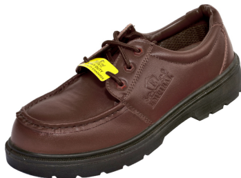
EXECUTIVE - Brown E1030402