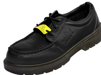
EXECUTIVE - Black E1030401