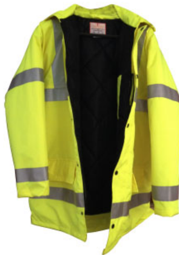
Arctic II E3045520