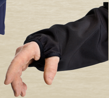
Elastic cuffs with thumb holder